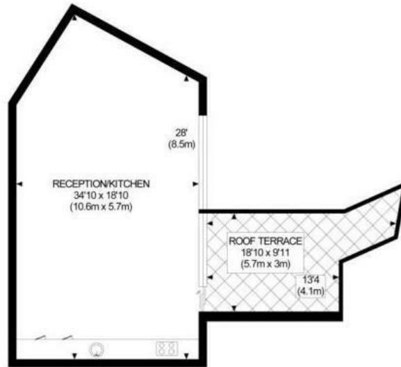
FIRST FLOOR GROSS INTERNAL FLOOR AREA 572 SQ FT